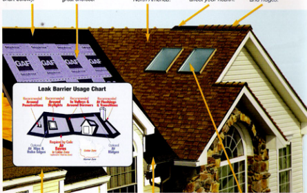
Leak Barrier Usage Chart

Similar to the way that a distinctive frame enhances a painting, Timbertex ® and PacificRidge ® can enhance the beauty and value of your home—while guarding against leaks at the hips and ridges.