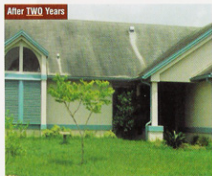
New roof without Algae-Eater™ Protection shows damage after just two years.