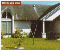
After seven years, the damage has become severe— as well as embarrassing!